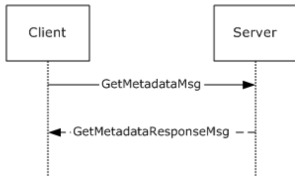
Figure 1: Message pattern of the User Profile Synchronization (UPS): Schema Exchange Protocol Profile

As an example of how the protocol server accepts a request message sent by a protocol client, as described in [WS-MetaDataExchange] , and the protocol server then returns a response message see section 4. The following figure, Message Pattern of the User Profile Synchronization (UPS): Schema Exchange Protocol Profile, illustrates this behavior.