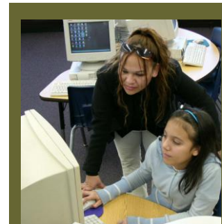
US: Parent's Alliance PACT Program

The South African Department of Correctional Services use Microsoft Digital Literacy for schools in crime-ridden areas as well as within prisons as part of their rehabilitation and skills transfer/development program to assist offenders to be better integrated back into society.