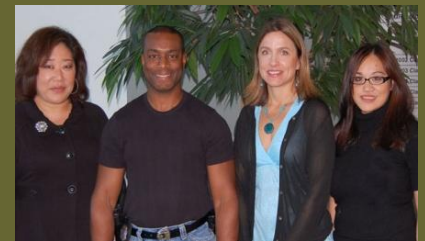
Sacramento, California State University Sacramento College of Continuing Education

We might not be able to answer the question of what the Internet will be in the future, but we can lay the groundwork for the proliferation of computer skills education and access so that citizens of both developed and emerging markets are ready to benefit from the next wave of change. Enhancing infrastructure; developing basic global standards for ICT curriculum; creating initiatives to support relevant local programs; and promoting ICT skills as essential to the health and wealth of a community. These are the ways in which governments, educational institutions, and private industry can work together to mutual benefit and effect profound change.