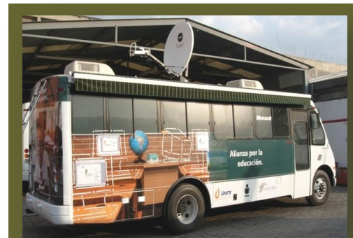
Mexico: Aulas Moviles

This grand effort to educate needs ICT evangelists and leaders with knowledge and vision who understand the power of computing to change lives forever. Every sector of society has a role to play. No one sector can provide it all—the infrastructure, the global curriculum, the localized programs, and the thirst for knowledge. We should never underestimate the impact on social change that is directly associated with the provision of connectivity and basic computing skills and the importance of our own individual contribution.