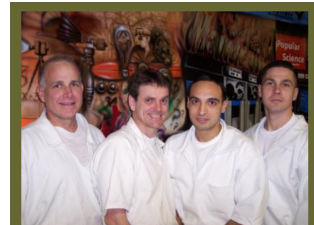
Texas: Wynne Computer Recovery Program

A wholesale move to virtual learning in the developed economy that has a comprehensive education infrastructure in place is unlikely. However, what is likely now is the more widespread engagement by students with the online community. The processes and operation of the online community are less alien, and once students are established users, the benefits of flexibility and resource saving soon become clear.