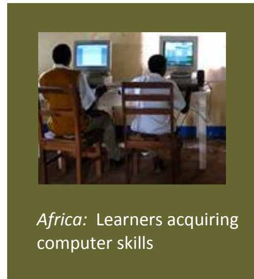
Africa: Learners acquiring computer skills

In central Africa, a municipal government identified that people with local knowledge were needed to make promotional films for ecotourism and wildlife conservation groups abroad. The ideal creators for the film content were local residents since they had lived with the wildlife and understood their habitat and behaviour. However, before any filmmaking could happen, the local citizens had to learn how to use digital recording and media management tools. Adding a basic computing skills course to media skills training