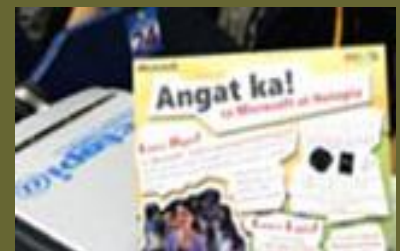
Philippines: Angat Ka! iCafé e-Learning Program

The miniaturization of computing devices and large-capacity data storage has produced a whole new and fairly recent phoneme. Individuals are unlikely to lose a vanload of patient medical records or a truckload of customer bank account details, but for data contained on a memory device the size of a coin, the risks are clear. The majority of cell phone users do not even take the minimum basic security precautions yet store highly personal information on these phones, including calendar dates, names and addresses, passwords, photographs, and financial information. Add to this risk the open nature of connectivity, and the security issues become substantial.