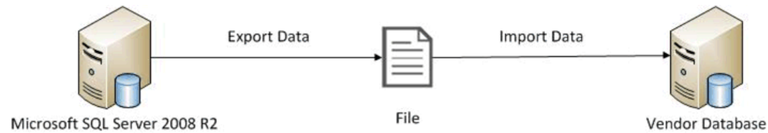
Figure 2: Export data

The data export scenario describes exporting customer data from a Microsoft SQL Server 2008 R2 database to files that a vendor can consume within its database. As shown in the following figure, a file containing the data can be created by using the bcp utility that ships with SQL Server. Data is exported in BCP format [MS-BCP] , or the vendor can export the data in Unicode text file format.