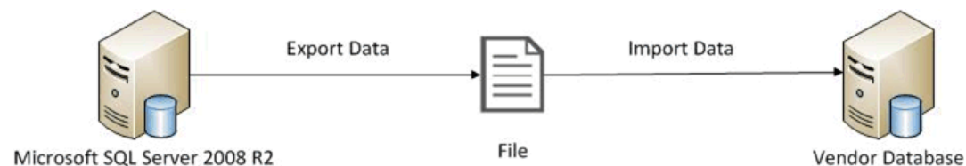
Figure 3: Import data

The data import scenario describes importing customer data from a vendor database that can produce files that contain data into SQL Server 2008 R2 database. As shown in the following figure, a file containing the data can be created by using the vendor's utility and imported into SQL Server. The vendor can export the data in Unicode text file format.