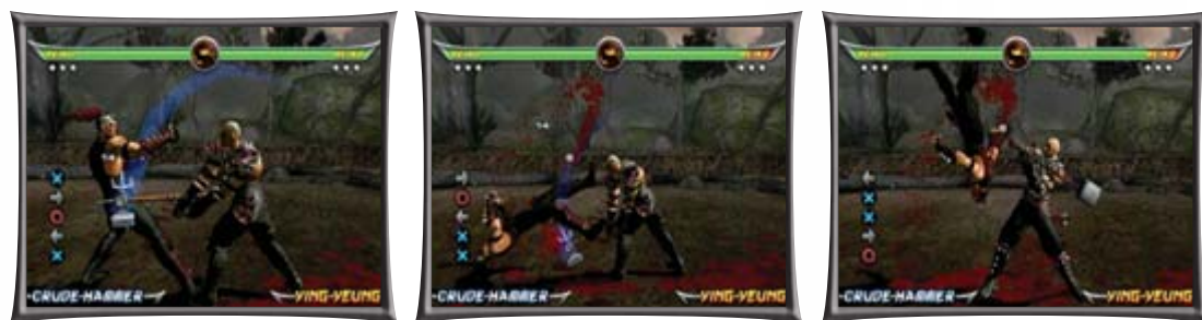
Crude Hammer: Hammer Stomper, Hammer Stomper, Krazy Swing (28% Damage)