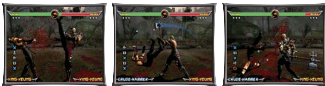
Ying Yeung: Fan Kick, Change Fighting Style, Hammer Stomper, Krazy Swing (19% Damage)