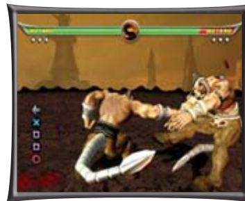
Horse: Donkey Kick, Donkey Kick, Double Elbow Kombo (36% Damage)