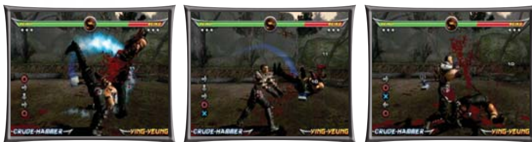
Crude Hammer: Devastating Flip Kick, Hammer Stomper, Krazy Swing (29% Damage)