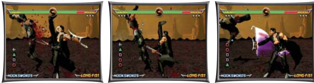
Hookswords: Blazing Fury, Double Axe Kick, Strength and Balance (38% Damage)