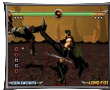
Hookswords: Blazing Fury, Double Axe Kick, Unholy Strength (39% Damage)