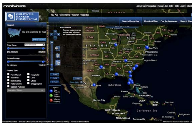
Coldwell Banker Commercial provides rich data about cities, property values, and more.