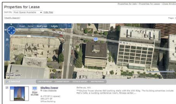
Experience captured from www.grubb-ellis.com

Example Scenario: It's a tough economy and competition is at an all-time high—Internet-based buying and selling services are readily accessible and there is no shortage of motivated commercial real estate agents. Your company needs to innovate and present value-added conveniences and services from your Web site to help win property buyers and sellers—and keep customers coming back to you.