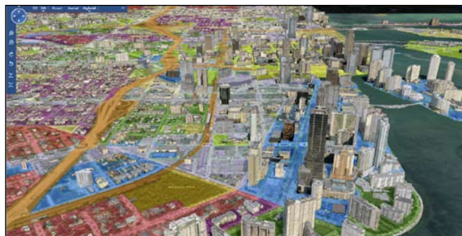
Experience captured from www.miamigs.com

Example Scenario: You work at a large property management firm that manages nearly 25 million square feet of property of varying types. Each day, hundreds of employees are dispatched to conduct inspections, make repairs, provide custodial services, and other property services. Your clients are generally satisfied with your service levels, but you could operate more efficiently.