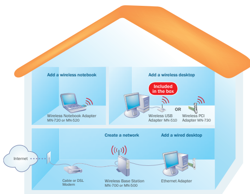
Share your broadband with the other computers in your home or small office. This diagram can help you determine which products you need for your personal network.

The data contained herein is subject to change. This document is provided for informational purposes only. Microsoft makes no warranties, expressed or implied, in this document.