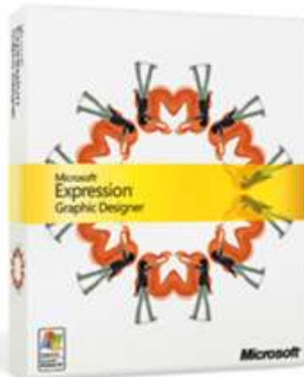
Microsoft Expression™ Graphic Designer

A professional illustration, painting, and graphic design tool to create compelling designs for on-screen, web, and application user interfaces.