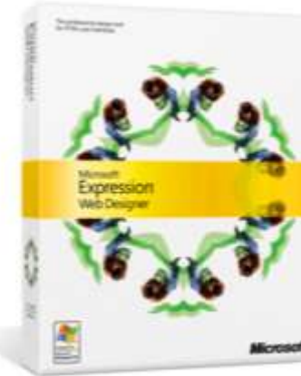
Microsoft Expression™ Web Designer

A professional design tool to create engaging, rich user interfaces for desktop applications and the web which deliver next generation user experiences on Windows Vista.