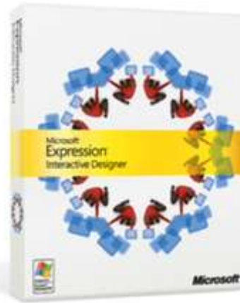
Microsoft Expression™ Interactive Designer

A professional illustration, painting, and graphic design tool to create compelling designs for on-screen, web, and application user interfaces.