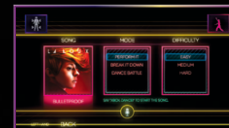
Voice Commander Screen

Say "Xbox, Dance" again to start playing after you've made selections.