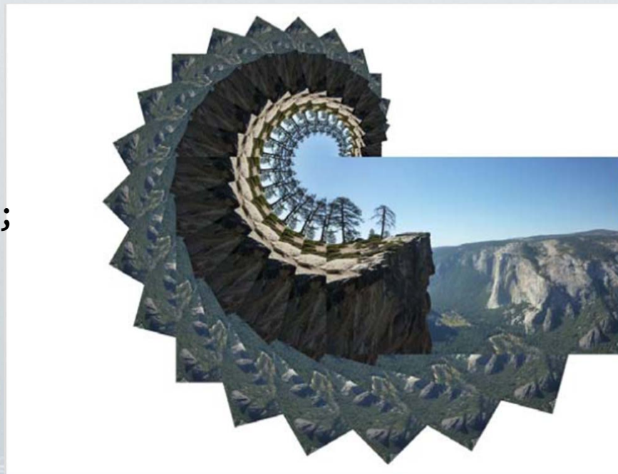
image.onload = function() { var rotate = 15; var scaleStart = 0.0; var scaleEnd = 4.0; var scaleInc = (scaleEnd-scaleStart)/(360/rotate); var s = scaleStart; for (var i=0; i<=360; i+=rotate) { s += scaleInc; context.translate(540,260); context.scale(s,s); context.rotate(i*-1*Math.PI/180); context.drawImage(image,0,0,120,80); context.setTransform(1,0,0,1,0,0); } };