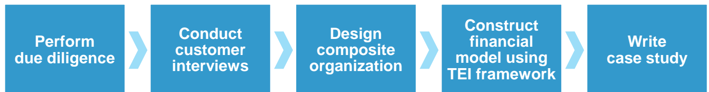
FIGURE 2 TEI Approach

Given the increasing sophistication that enterprises have regarding ROI analyses related to IT investments, Forrester's TEI methodology serves to provide a complete picture of the total economic impact of purchase decisions. Please see Appendix B for additional information on the TEI methodology.