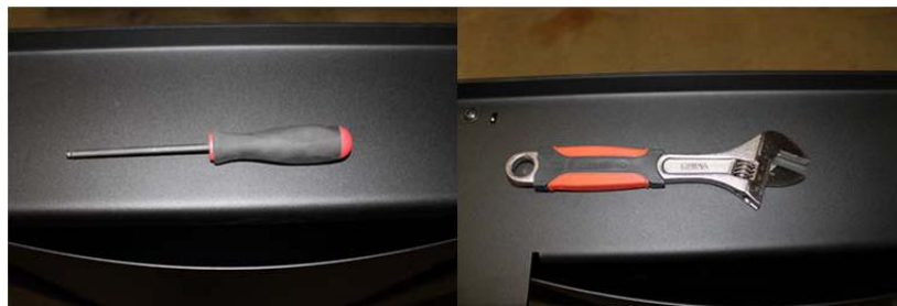
Figure 1. Recommended tools: 5mm hex screwdriver and adjustable wrench