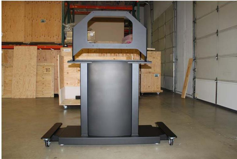
Figure 3. Bracket on top of stand