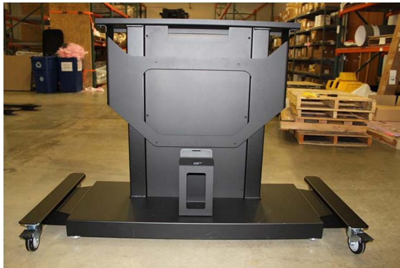
Figure 2. Fixed vertical stand in shipping configuration