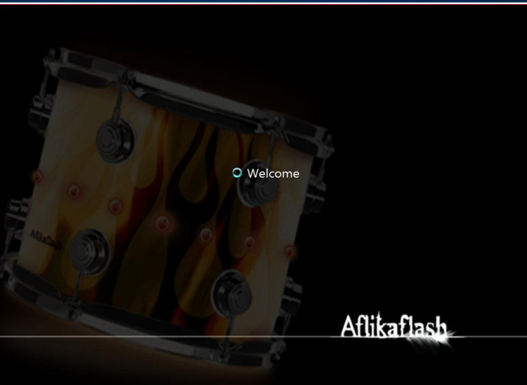
Figure 2- Windows Embedded Standard 7 Branding