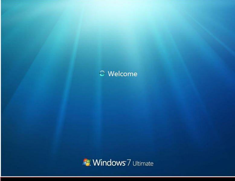
Figure 1- Windows 7 Branding

The Windows default background is a straight giveaway that the underlying operating system is Windows based. This package lets you replace the logon desktop background images. Using this package with the Unbranded Startup Screens package offers a comprehensive method of rebranding Windows startup.