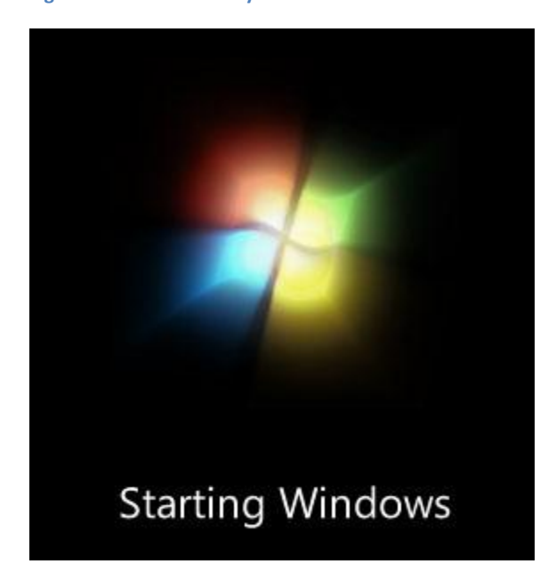
Figure 5- Windows Firefly boot animation

The Windows boot and resume process contain animations and messages shown by the Windows Kernel. These messages and animations can be removed by adding the Hide Boot Screens. After it is installed, no messages or animations are shown and the screen remains black until the startup screens are displayed. It is currently not possible to replace the black screen with a custom OEM image.