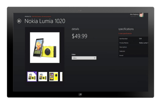
Multiple screens in Modern POS

The Modern POS will consolidate customers' purchase intelligence – such as sales history, transaction details, and wish list - and provide the right information at the right time for sales associates to better guide and recommend their customers based on purchase patterns and preferences.