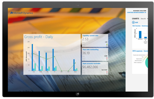
Start screen of Microsoft Dynamics Business Analyzer

Help accelerate your business with actionable and engaging business insights. Tailored for specific roles Microsoft Dynamics Business Analyzer provides preconfigured business insights and a user experience that can be personalized to fit your needs. Whether you are in the office or on the go you can discover and interact with your favorite charts and financial reports or collaborate and share insights to help drive decisions more quickly.