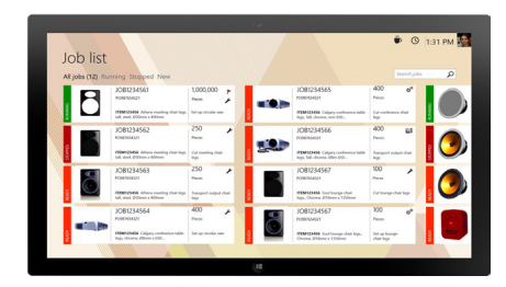
Overview of production jobs in Microsoft Dynamics AX Shop floor modern app