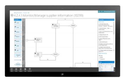
Business Process Modeler in Microsoft Dynamics Lifecycle Services

View specific meta-data or click through to the specific Microsoft Dynamics AX screen directly from the process symbol in the flowchart.