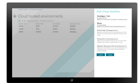
Microsoft Azure Deployment Portal in Microsoft Dynamics Lifecycle Services