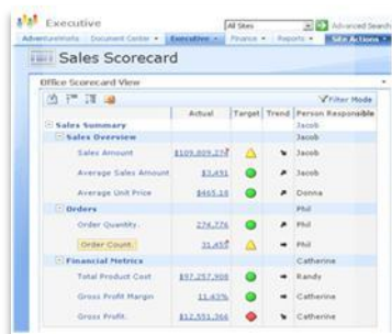
Key Performance Indicators

Manage enterprise-wide key performance indicators (KPI's) centrally by using the Analysis Services KPI Framework — a rich centralized repository for defining, storing, and managing KPIs. Make centrally stored KPIs available to users through a variety of applications, including Microsoft Office PerformancePoint™ Server 2007, Microsoft Office Excel® 2007, Microsoft Office SharePoint® Server 2007, and SQL Server Reporting Services