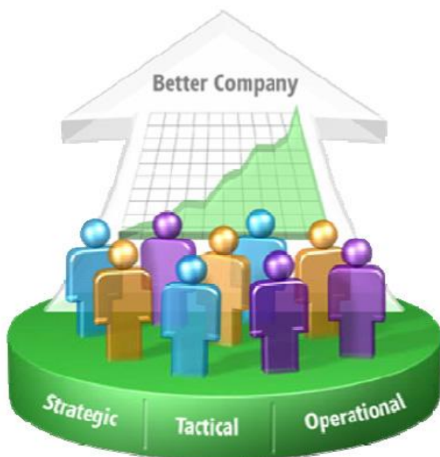
Figure 1. Microsoft BI supports three types of key decisions for improved business results.

Tactical decisions give a business short-term advantage. For example, a product manager decides what discount schedule to put in place or makes a pricing decision for a new product. BI has traditionally been implemented at the tactical level.