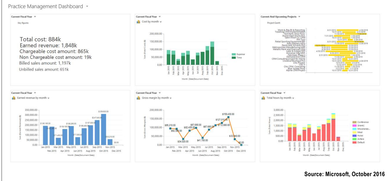
Figure 2: Microsoft Dynamics 365 for Project Service Automation (PSA) Dashboard