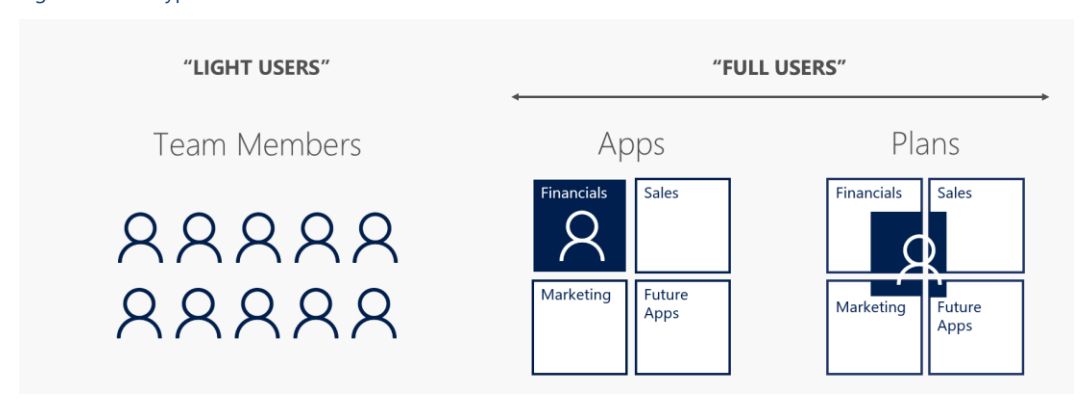
Figure 3: User Types