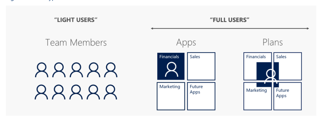
Figure 3: User Types